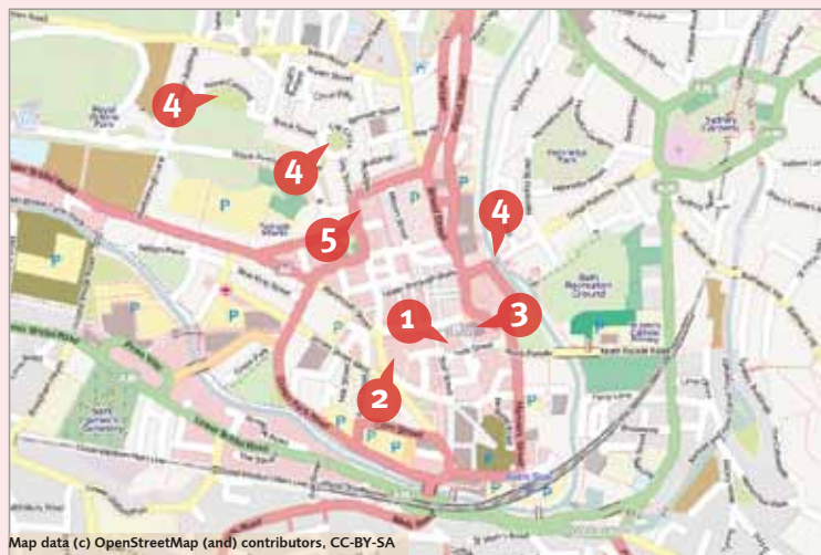
Map data (c) OpenStreetMap (and) contributors, CC-BY-SA